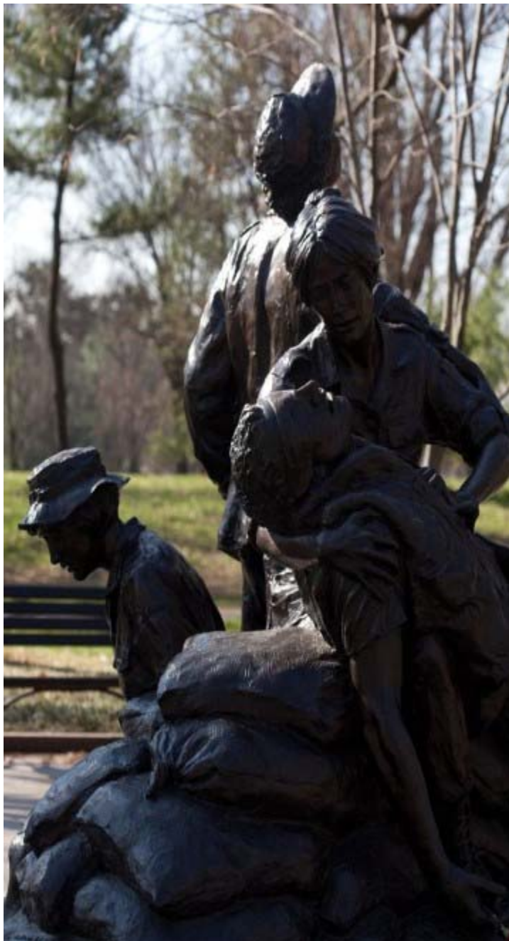
Vietnam Women's Memorial, Washington, D.C.