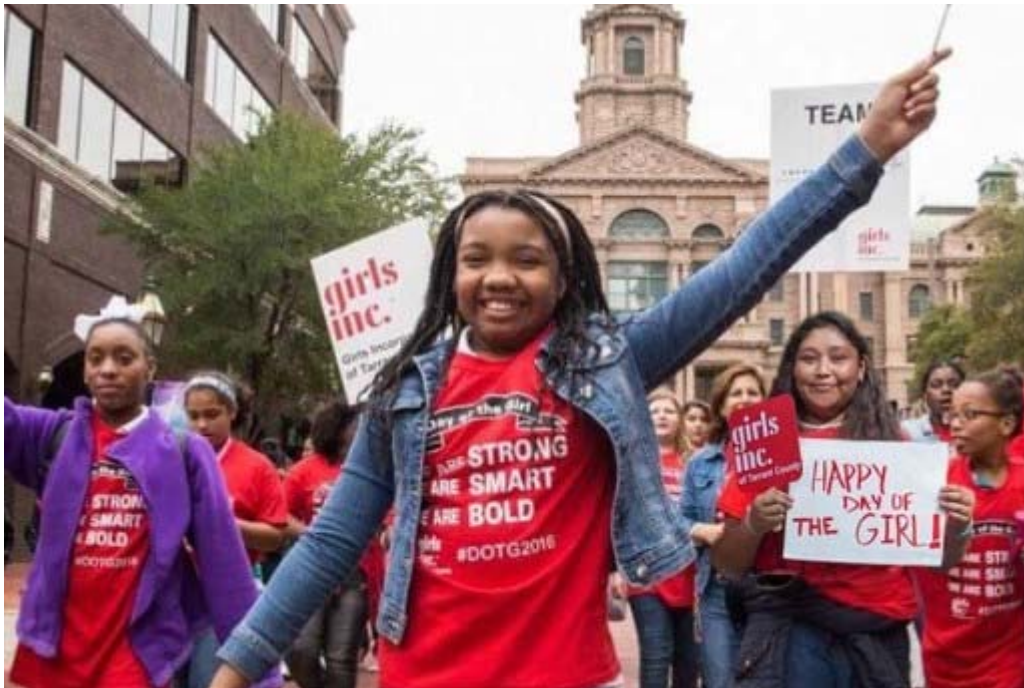
Day of the Girl celebration